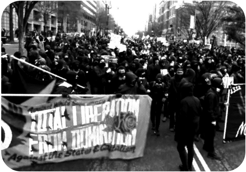
Washington, DC, January 20, 2017.

It sounds like a metaphor, but I mean it literally as well as figuratively. Whether it's a march or a court case, sometimes it's safer in the front.