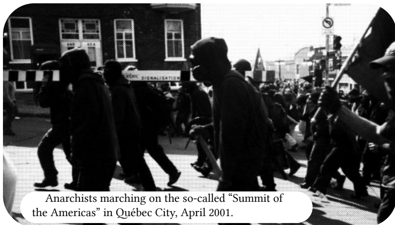
Anarchists marching on the so-called “Summit of the Americas” in Québec City, April 2001.

We marched directly to the fence surrounding the summit and tore it down. The police could not stop us. The “Free Trade Area of the Americas” was never ratified.